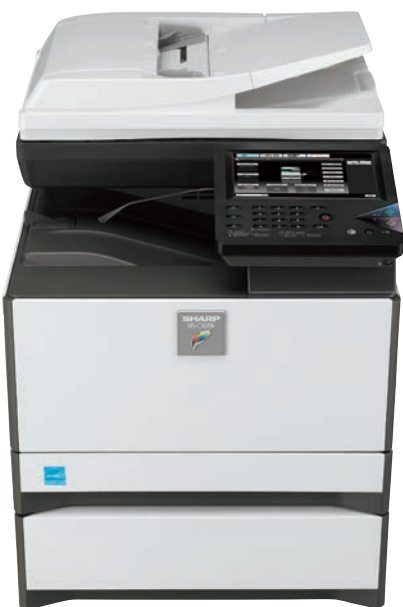
Shown with optional paper drawer.